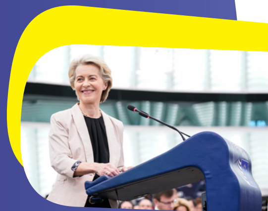
Ursula von der Leyen President of the European Commission

As of 2025, the new joint network of EU Local Councillors will be fully operational. Members will receive a series of revamped products featuring a new visual identity, including a new newsletter, while keeping their privileged access to key EU products and services, website, etc.