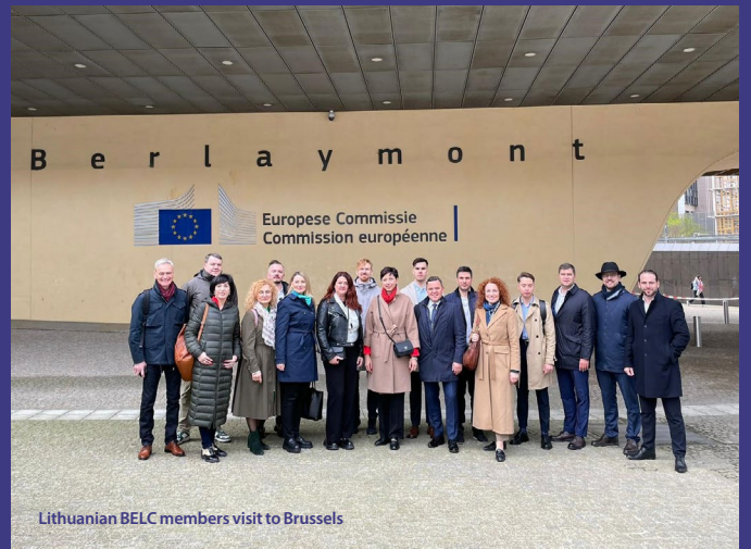
Lithuanian BELC members visit to Brussels