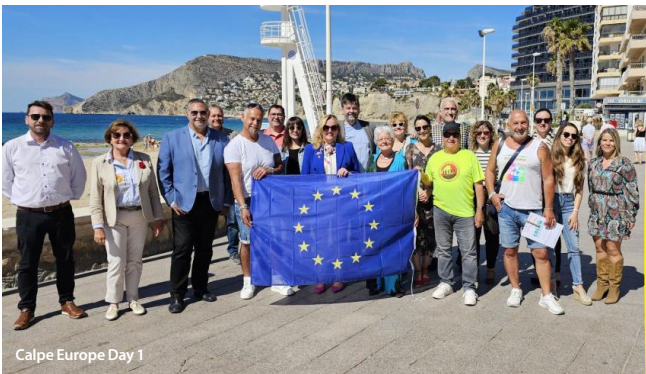
Calpe Europe Day 1

important mental health and wellbeing issues with over 300 attendees, including professionals, educators, and local leaders, culminating in a commitment to join the European Alliance Against Depression.