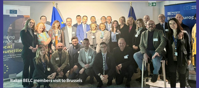
Italian BELC members visit to Brussels