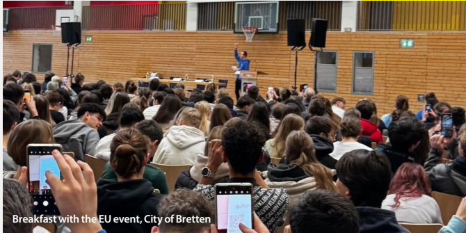
Breakfast with the EU event, City of Bretten

BELC members have been very active in engaging citizens in the run up to the European elections. Here is just a snapshot.